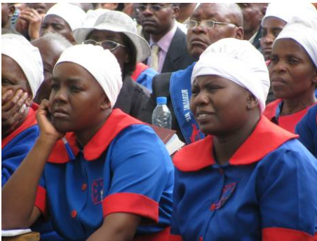
The blue, red and white uniforms of the United Methodist Women were very visible.

with You Till We Meet Again' (he had recorded it shortly before he died). An altar call was given during the service, and many went forward to receive, or rededicate their lives to, Christ. The pastor-in-charge looked up and "invited" the bishop to watch the exciting events that were taking place below at his funeral! May we all have such confidence in God's grace that we can face death with no fear!